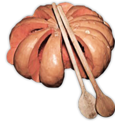
a pumpkin drum